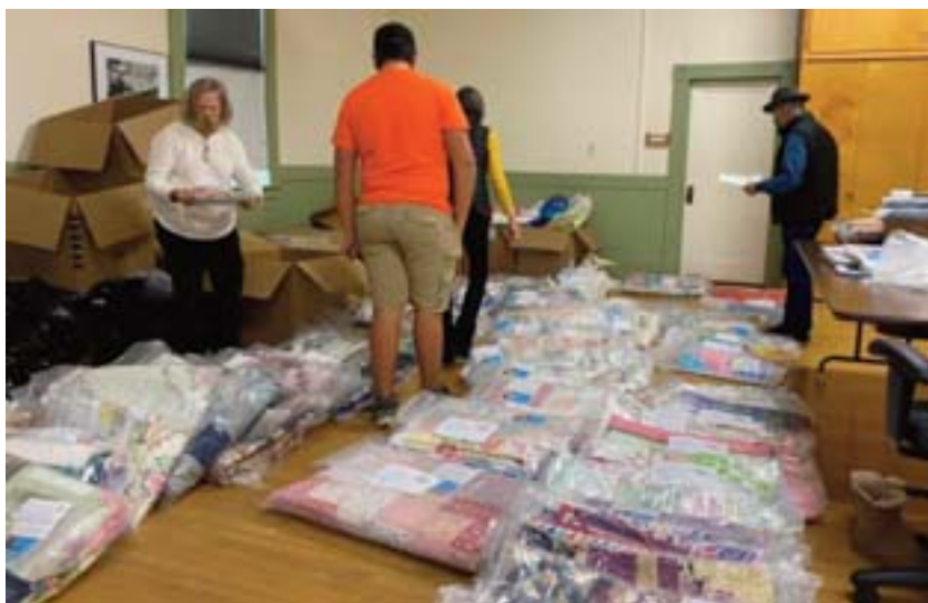
Volunteers for the West Coast Celebration for World Relief in California help prepare quilts for sale in 2020. Sale organizers have held three online quilt auctions in lieu of in-person sales since the start of the COVID-19 pandemic.