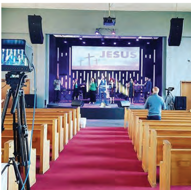
Medhane-Alem Evangelical Church of Seattle (Wash.) holds a live online service March 22.

As shelter-in-place orders and social distancing guidelines were introduced in early March to curb the spread of the coronavirus and limits on the number of people who could gather face-to-face continued to drop, USMB congregations creatively adapted their activities and ministries to meet local, state and national recommendations that initially changed almost daily.