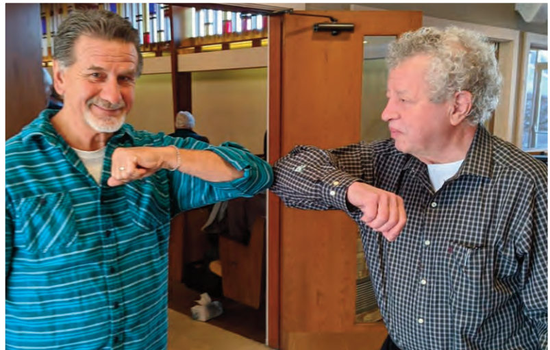
Before shelter-in-place orders limited gatherings, attendees at Kingwood Bible Church, Salem, Ore., March 16 say hello a new way.