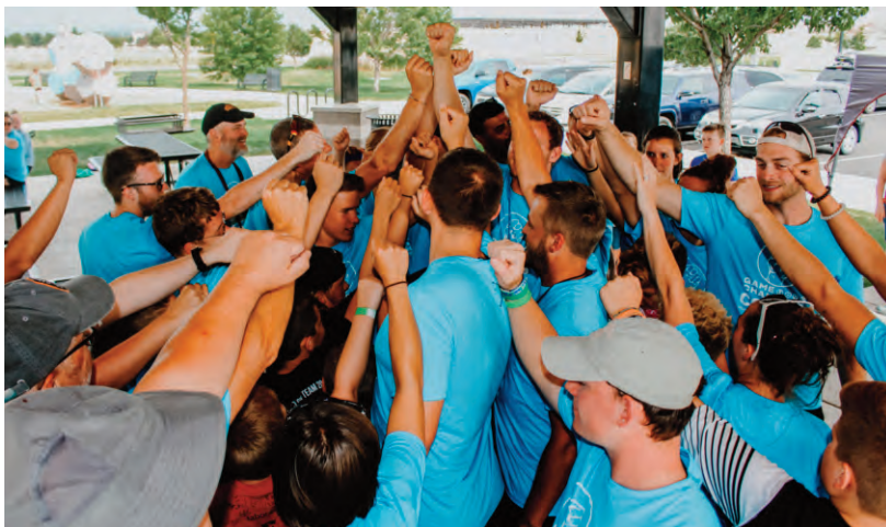
Game Changers coaches huddle before kids arrive for the character-based sports camp offered by Greenhouse Community Church, Saratoga Springs, Utah, in partnership with a team of Midwest coaches and athletes.

100 YEARS | MCC Relief, development and peace in the name of Christ