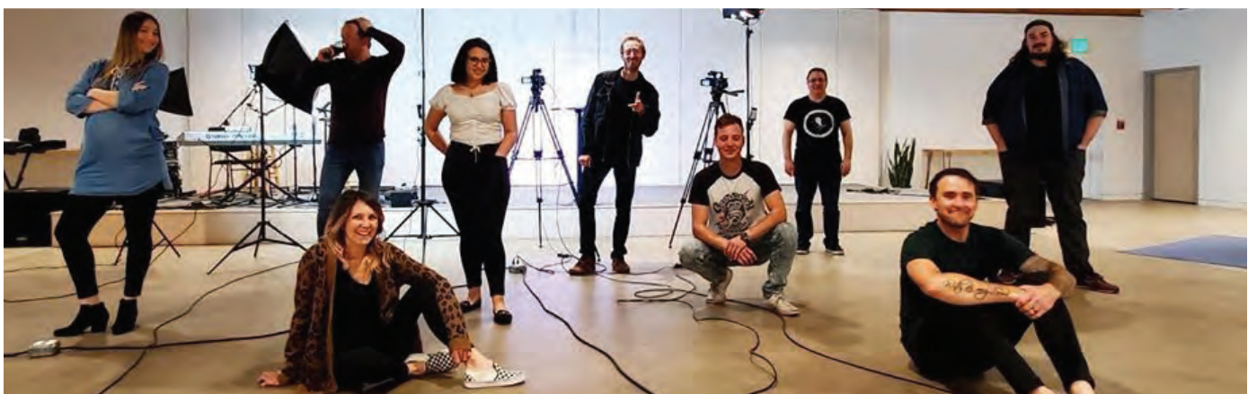
The "physically distant" Sunday crew at Axiom Church, Peoria, Ariz.