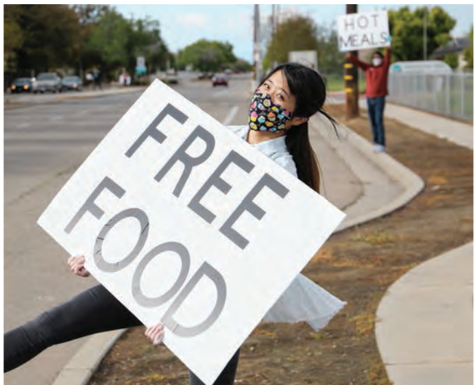
Mountain View Church, Fresno, Calif., distributes hot meals to needy individuals and families.