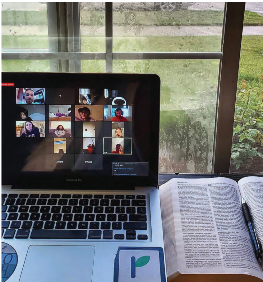
Students at Prodigal Church, Fresno, Calif., meet online for their weekly Bible study.