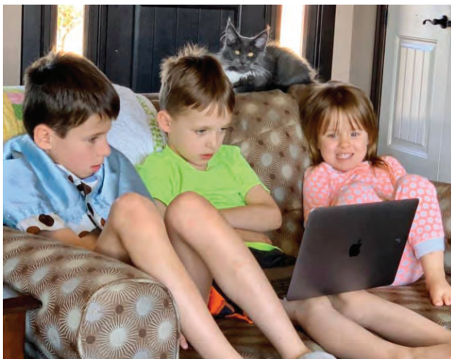
A family from First MB Church, Wichita, Kan., have church at home.