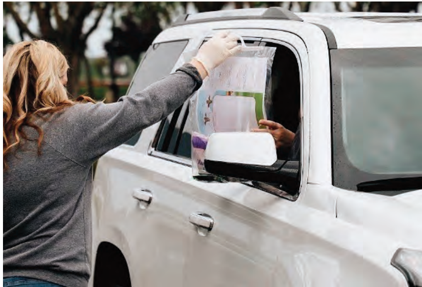
Distributing Drive-Thru Family Fun Packs is one way Neighborhood Church is responding to needs in its Visalia, Calif., community related to stay-at-home orders put into place in March as a result of the coronavirus.

Because NC already streams its services online and offers a podcast, the