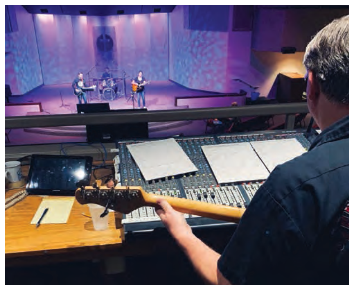
Live stream services at Bethany Church, Fresno, Calif., allow for multitasking.